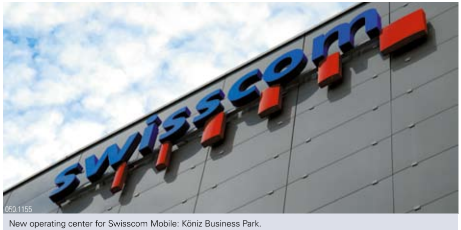
050.1155 New operating center for Swisscom Mobile: Köniz Business Park.

needs a solid, reliable but also flexible operation center. Swisscom Mobile has found just that in the Köniz Business Park.