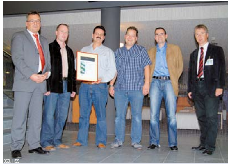
050.1159 Atel and R&M representatives handing over the quality certificate to Swisscom.