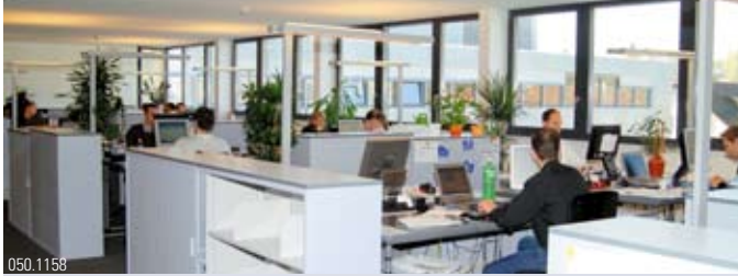
050.1158 The Swisscom employees have the latest infrastructures at their fingertips.